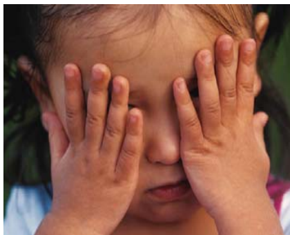
Please help keep our youth safe and drug free.

2. Treatment for Methamphetamine Abuse – Support is needed for the creation of a full-service partnership to provide methamphetamine treatment services for abusers and their families utilizing in-home support services to maximize independence of families.